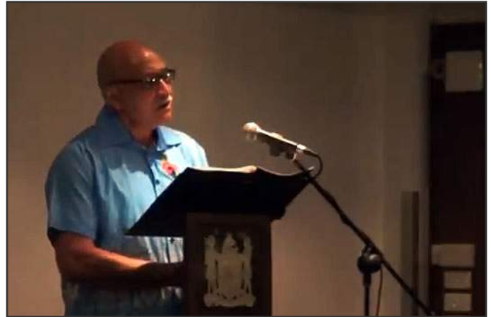
His Excellency the President of the Fiji Islands delivering his keynote address

Ladies and gentlemen, as the Leadership Fiji programme evolves, I appeal to you to strengthen the ideals of inclusivity and the implementation of policies and programmes that are of the national interest. Specifically, I ask that you reflect on the path that our country has taken since independence; by learning from the past, it becomes clear that compromise and inclusivity has led to a far brighter Fijian future than fear and division. While we will all agree that it is part of human nature to have different views and ideologies on certain issues, it is crucial that national