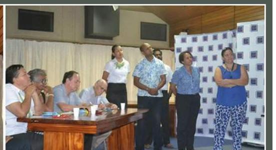
Community projects listed overleaf. Above photos taken at the LF2016 Group Vision Presentation at the Reserve Bank of Fiji, Suva.